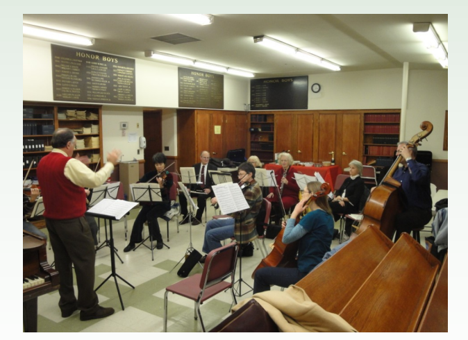
The group on 12/18, before we started partying. Thanks for coming — we had a great time!