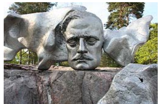
The Statue of Sibelius in Helsinki