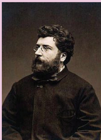
Georges Bizet 1838—1875

Due to a camera software malfunction, no photos this week, but here's a rogue's gallery of our composers dujour.