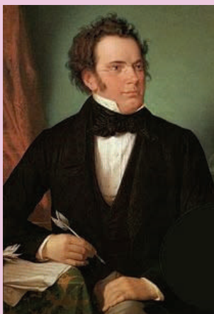
Franz Schubert 1797—1828